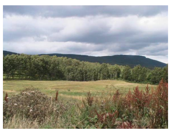
Fig. 2: View of proposed site, looking westwards

1. This application is for approval of reserved matters for the erection of 140 houses and associated infrastructure and landscaping. subject site is located on land to the north of Aviemore Highland Resort in an area known locally as 'the Horsefield' or 'the Ponyfield' and was used in the past as a golf course associated with the Old Aviemore Hotel. The overall site area extends to approximately 20 acres and is bounded to the west by the A9 Trunk Road, by an area of open ground to the north and by the Aviemore Burn and existing residential development on Craig-na-Gower Avenue to the east. The majority of the southern site boundary is bounded by properties within the Scandinavian Timeshare Village, with the remainder of the southern site boundary adjoining a portion of land which is also the subject of a current application by the same applicants (Tulloch Housing (Aviemore) Ltd.) for a development of 21 dwelling units (CNPA planning ref. no. 05/304/CP refers).