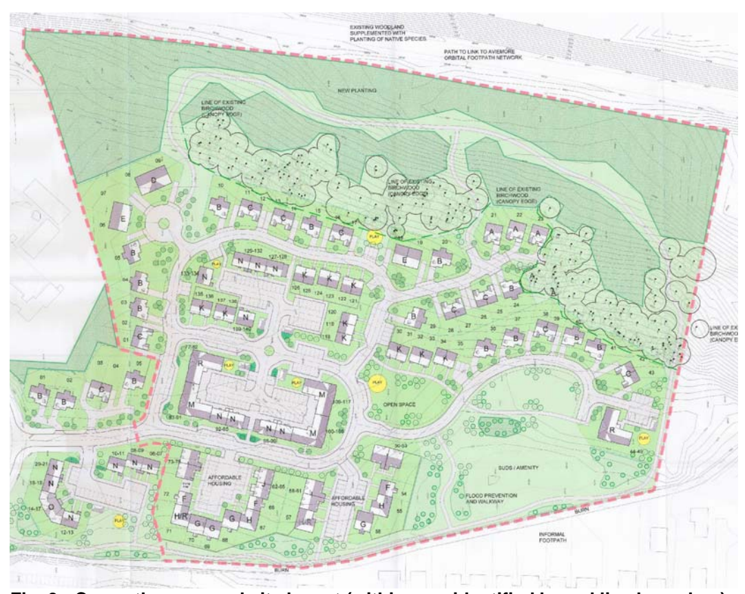
Fig. 3: Currently proposed site layout (within area identified by red line boundary)

space curtailed to the outer areas i.e. between the outer facing elevations of the apartment blocks and the main access road which encircled the central area. The central area of the development as originally proposed contained 63 apartments / flats, while a further 16 apartments / flats were proposed within the affordable housing element in the western area of the site. Much of the remainder of the development, with the exception of a number of terraced properties within the affordable housing element, consisted of either detached or semi detached properties. At least 15 of the dwellings proposed towards the eastern area of the site were positioned to result in encroachment into the canopy edge of the existing birchwood plantation.