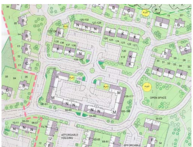
Fig. 4: central courtyard area accommodating property types K,N,M and R

to a greater extent than previously proposed. The majority of the apartments / flats, have direct access to small areas of open space, some of include play areas. In addition the structures accommodating the flats are generally located within a short distance of larger areas of open space and play areas, and are linked to the areas via a network of pathways. Bicycle storage buildings have also been incorporated into the layout at various locations, primarily adjacent to the flatted units.