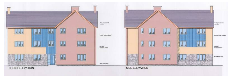
Fig. 16: Type M - 2 bedroom flatted units on each floor